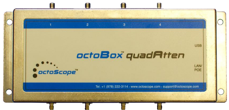
octoBox quadAtten module

octoBox quadAtten is an exceptionally well isolated with filtered USB and Ethernet interfaces.